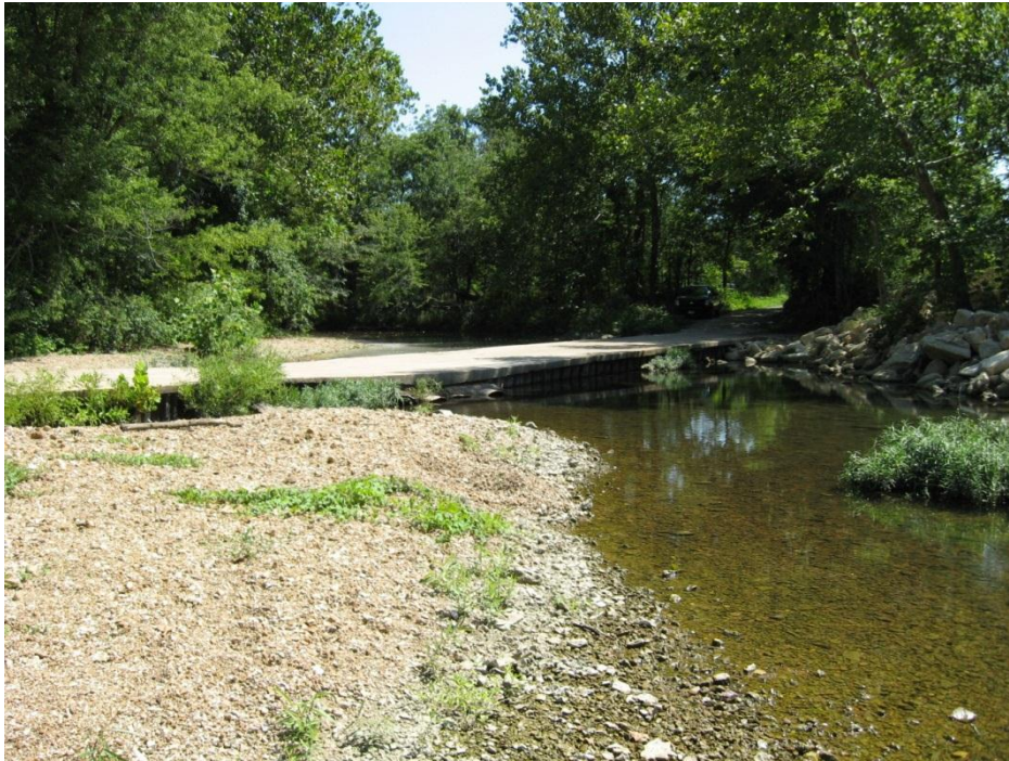
Griffith Road Before Picture