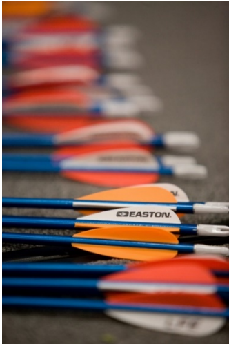
Exhibit Booths - Vendor Area

As a flight sponsor, your company will be a main contributing event sponsor. Your company representative will welcome tournament participants over the PA system in between competition flights.